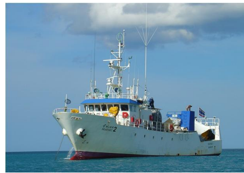
M.V. SEAFDEC2 (2004 – Present)

Figure 1 shows SEAFDEC research vessels; MV. SEAFDEC and M.V. SEAFDEC2