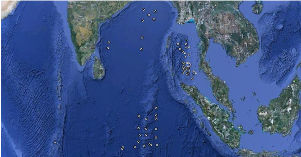
Figure 2 shows area of operation in Andaman Sea, Bay of Bengal and Eastern Indian Ocean