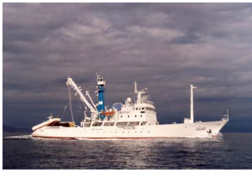
M.V. SEAFDEC (1998 – Present)

following year. Fishing area of M.V. SEAFDEC2 is in Andaman Sea from Latitude 18°N to 10°S and Longitude 88° to 96°E. The fishing periods were from October to March of following year.